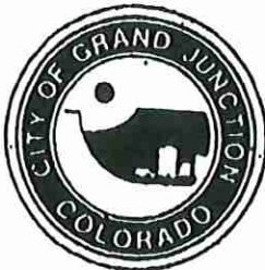
EXHIBIT "A" DESCRIPTION OF "THE PROPERTY" Dry-Grazing Lease B

The SE ¼ of the NE ¼ and the NE ¼ of the SE ¼ of Section 25, Township 2 South, Range 1 East of the Ute Meridian,