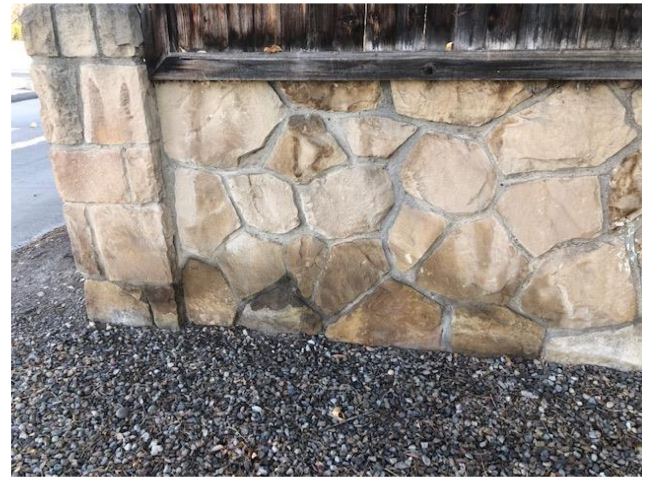
Existing low wall along alley – to be refaced with flagstone to match other existing walls on the property