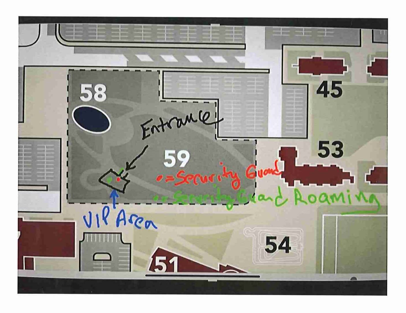
Thanks Sent from my iPhone