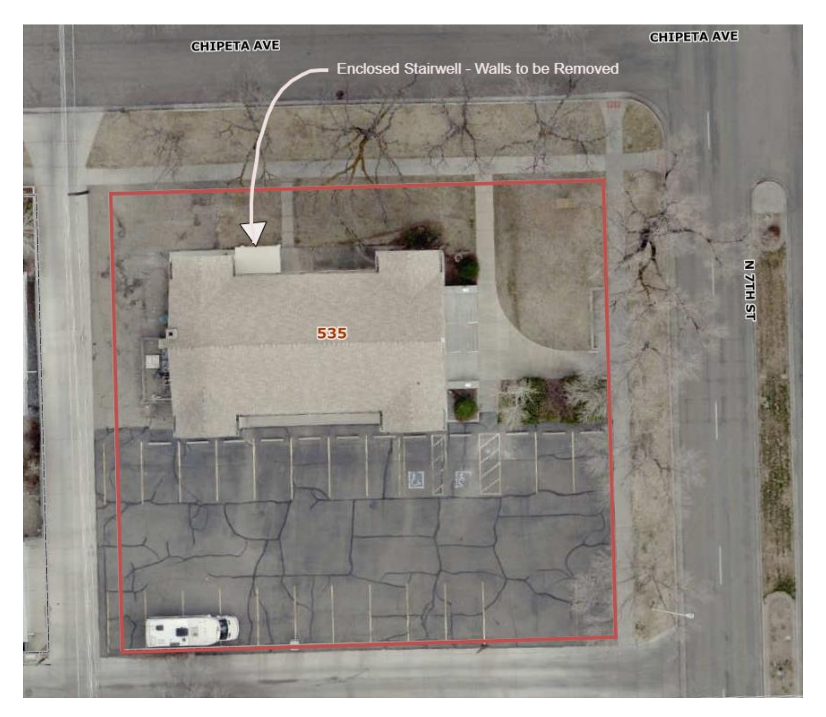
Packet Page 6