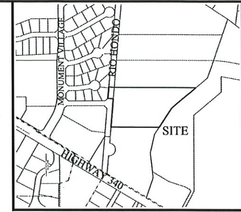
LOCATION MAP: NOT-TO-SCALE

LYING IN LOT 2 OF SECTION 23, TOWNSHIP 11 SOUTH, RANGE 101 WEST, 6TH PRINCIPAL MERIDIAN COUNTY OF MESA, STATE OF COLORADO