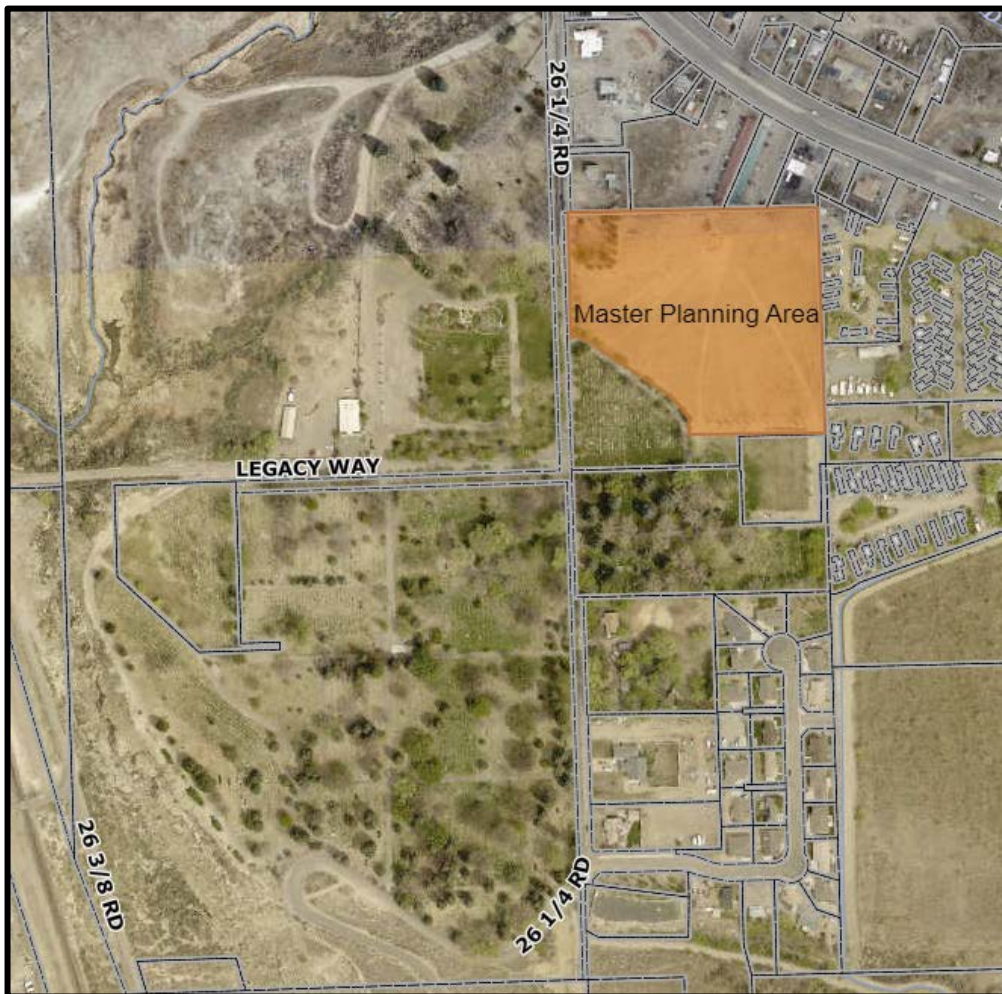
Figure 2. Master Planning Area

Just north of the St. Anthony and Calvary burial grounds, there is approximately 8 acres of unimproved landscape, slated for future development. To ensure that the development of this parcel fits within the historic character of the existing facility a master plan, which outlines the site layout and concept plans of the infrastructure, landscaping, and burial sites, is required.