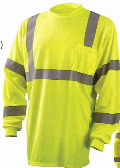
LONG SLEEVE LUX-LSETP3B