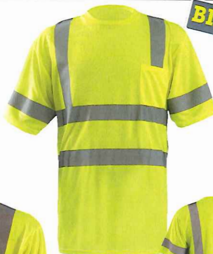
SHORT SLEEVE LUX-SSETP3B