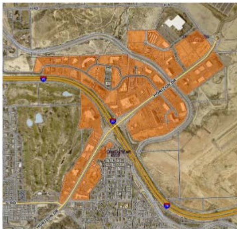
Horizon Drive BID zone