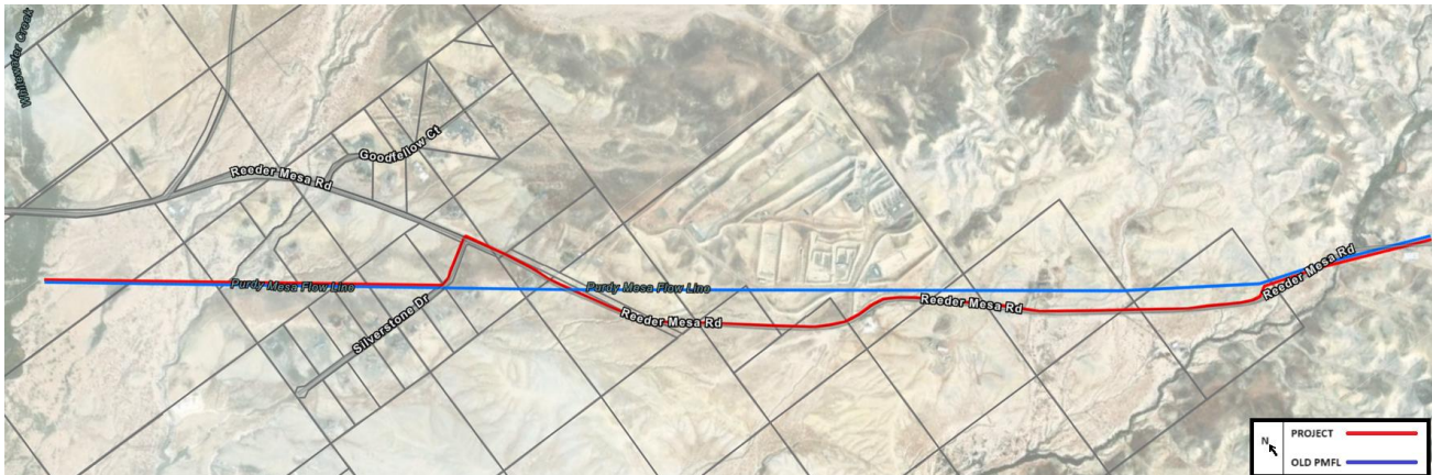
2024 Purdy Mesa Flowline Project Map

3.4 SCOPE OF WORK: The 2024 Purdy Mesa Flowline Project places approximately 15,850 FT of 20" PVC pipeline. This placement follows the old PMFL alignment for 6,350 FT and has 9,500 FT of new alignment. In segments of adjacent alignment the old PMFL pipeline will be abandoned and left in place, except for exposed segments and the tie-in's at both ends of the Project. There are two segments, totaling 150 FT near Whitewater Creek, where the old PMFL is exposed (above ground) with structural supports. These exposed segments will be removed and plugged with concrete. For all exposed segments the new pipeline will be encased in concrete.