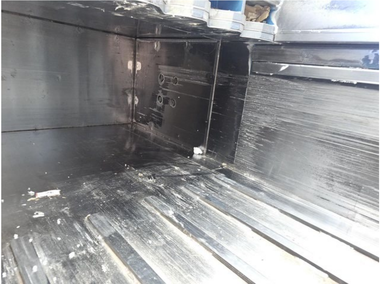
End of Exhibit I – Photos of Eject Chamber Floor