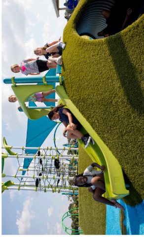
Play Mound + Slide