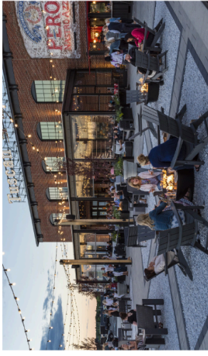
Firepit Gathering Area