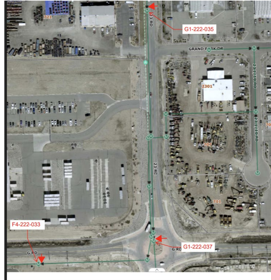
2026 River North Flow Meter Location Map