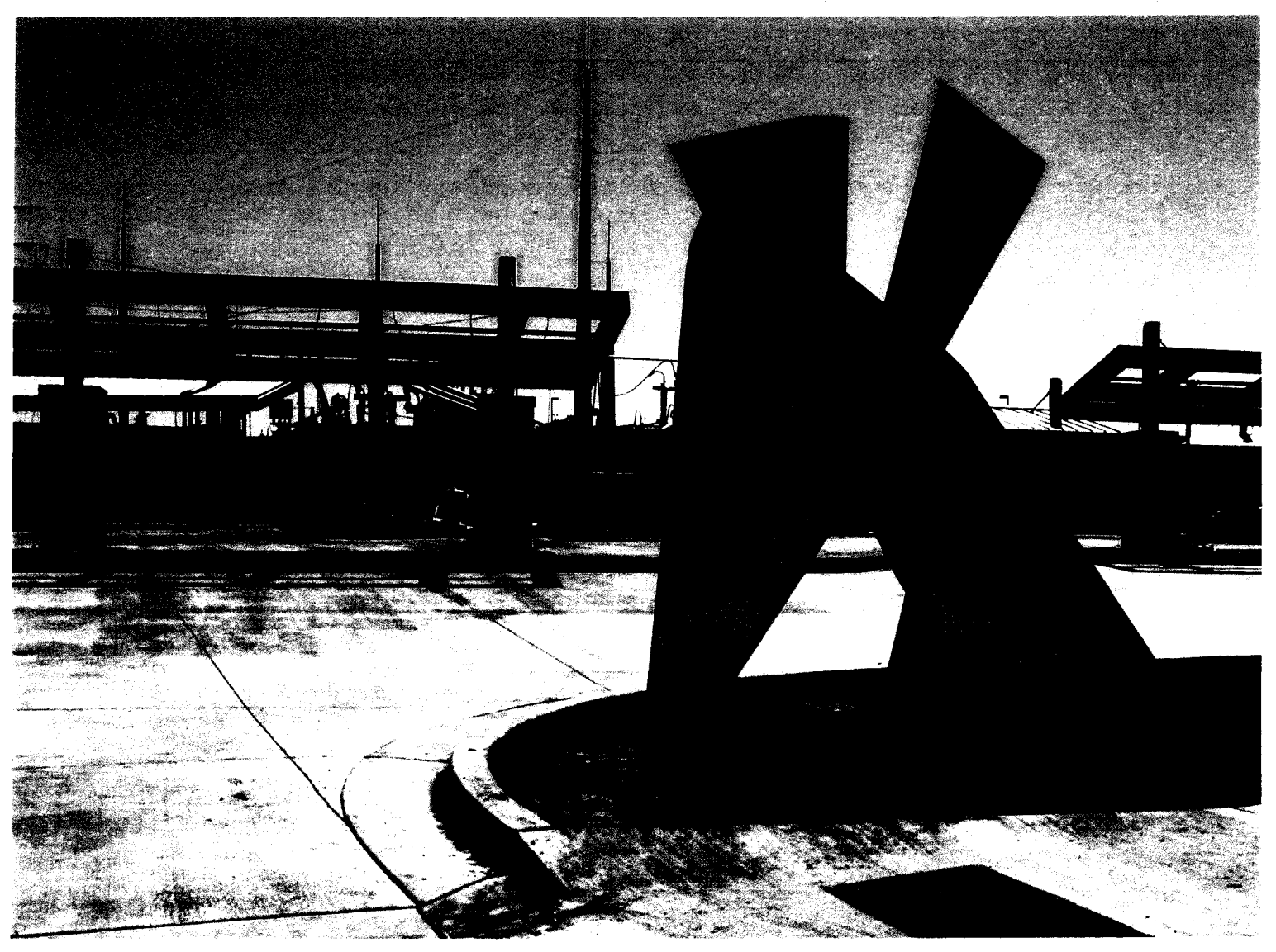
"Local Motion" Proposal #2, Site #2 folded perforated steel 9'7"H x 7'0"W x 5'7"D