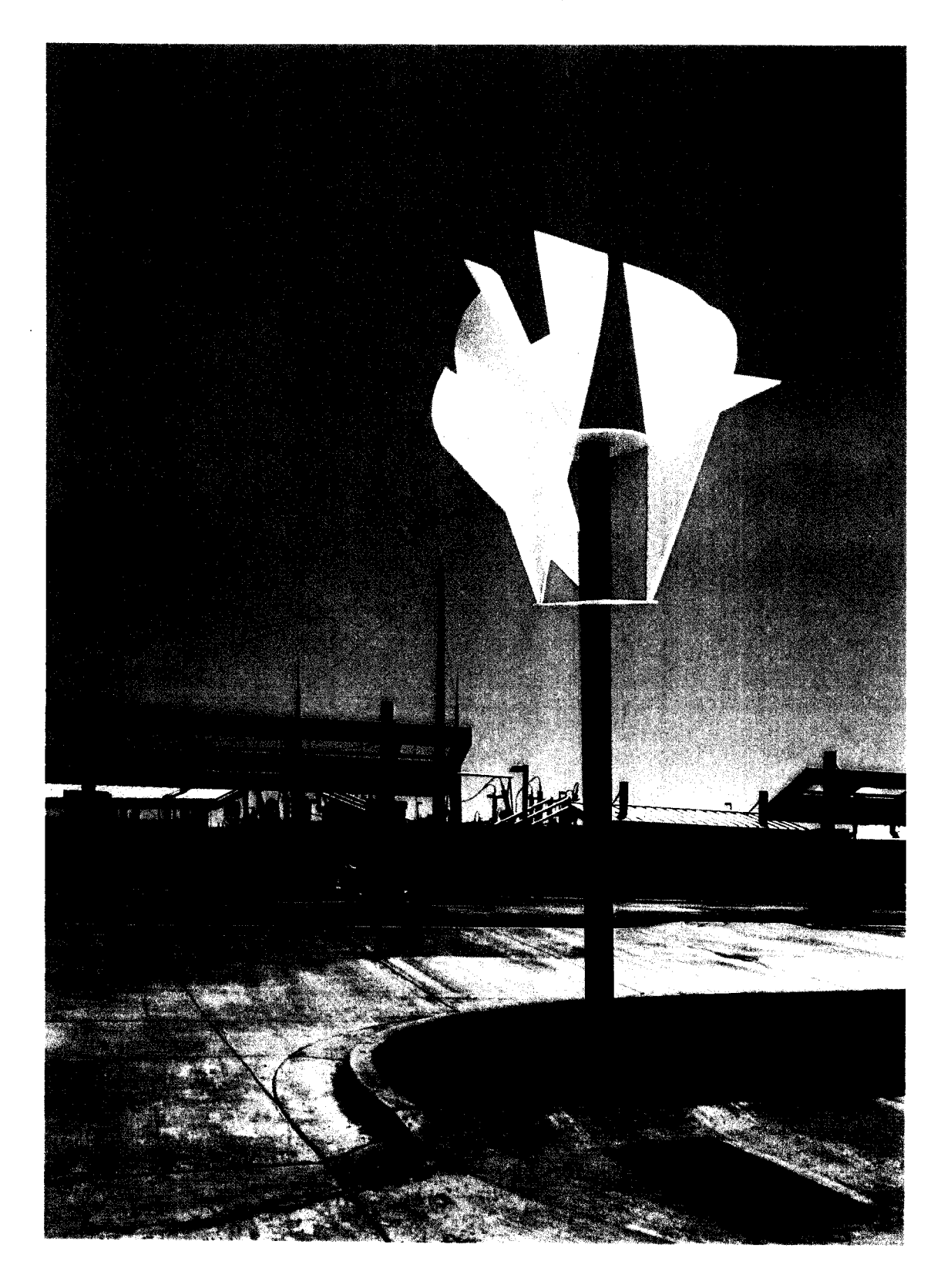
"Local Motion" Proposal #1, Site #2

folded perforate steel 16'6"H x 9'0"W x 8'3"D