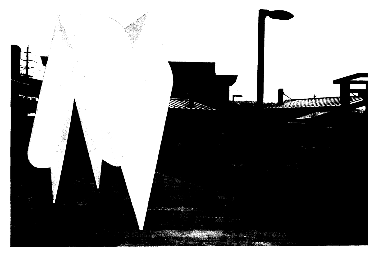
"Local Motion" Proposal #2, Site #1 folded perforated steel 9'7"H x 7'0"W x 5'7"D