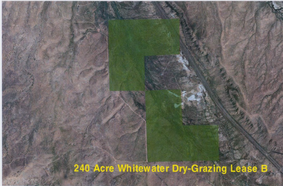
240 Acre Whitewater Dry-Grazing Lease B