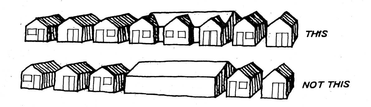
Figure 3.1 Treatment of Architectural Elements

<u>Facades and Fenestration</u>. All sides/facades of a building shall be composed of several bays or sections, which are similar in scale to the residential structures in the surrounding neighborhood. Fenestration shall be visually compatible with surrounding residential structures. Visually compatible includes the relationship of width to height and the provision of windows and/or doors. Refer to Figure 3.1 below.