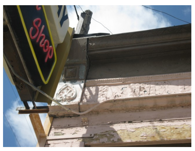
Eliopulos Grocery Store 319 South 2<sup>nd</sup> Street