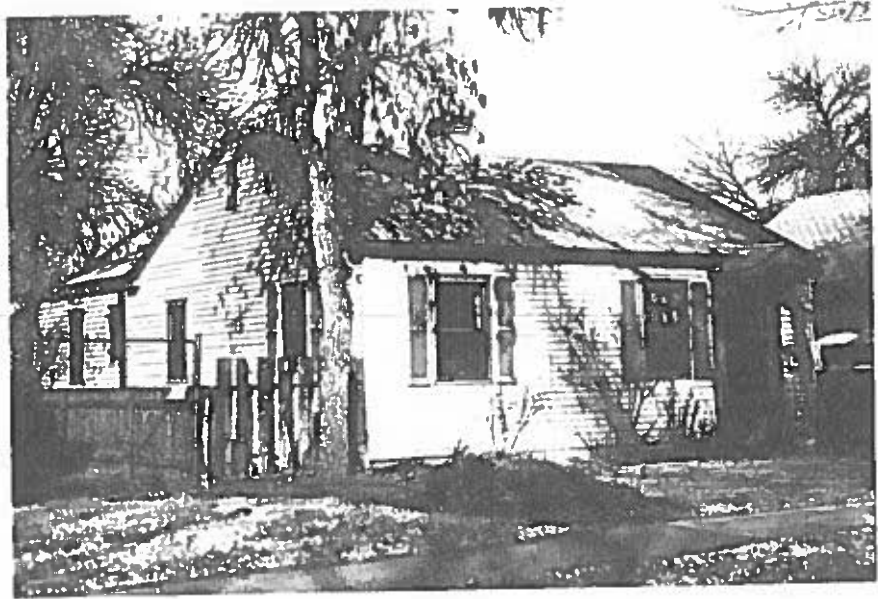
420 Teller Ave. , Grand Junction, Mesa Co, CO 2945-142-09-013 02/07/1996 Roll 28 Frame 08 View S Dir N/NE 5ME 8183