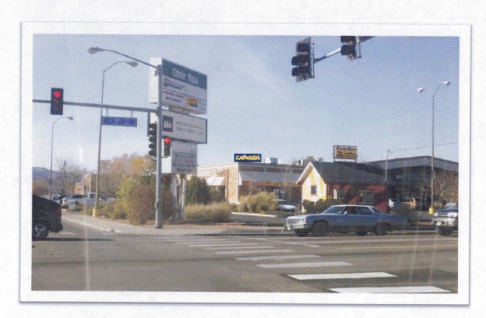
Photo 2 – View looking west from intersection of North Avenue and N. 7^{\text{th}} Street