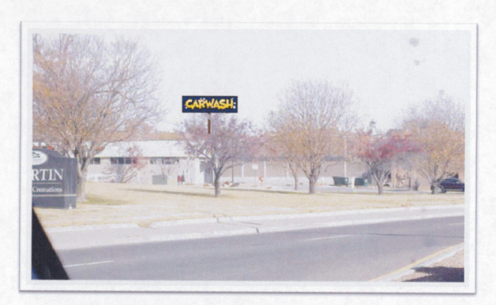
Photo 1 - View looking east along North Avenue, approximately 400-feet west of site.