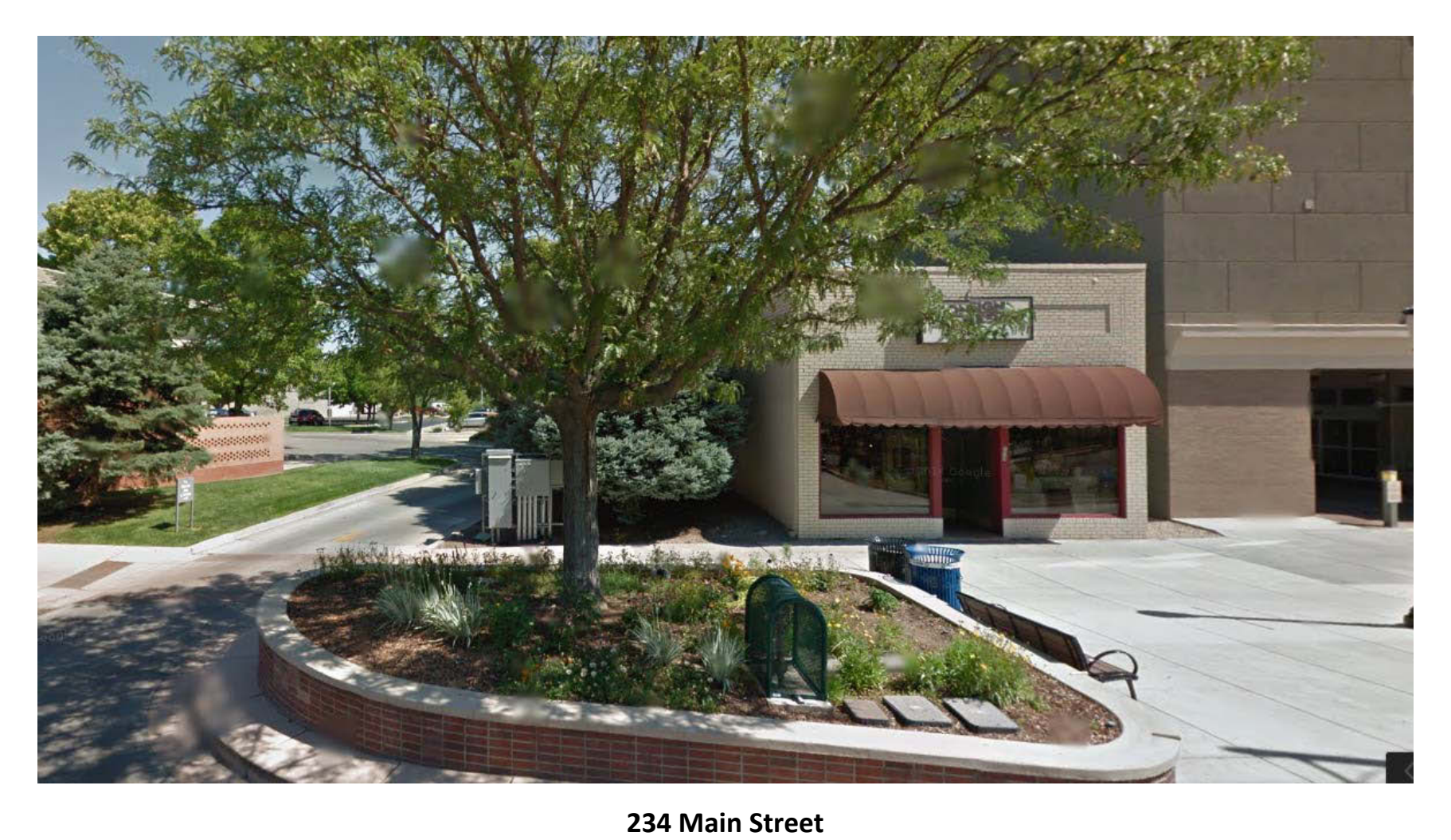
Current Google Street View July 2012