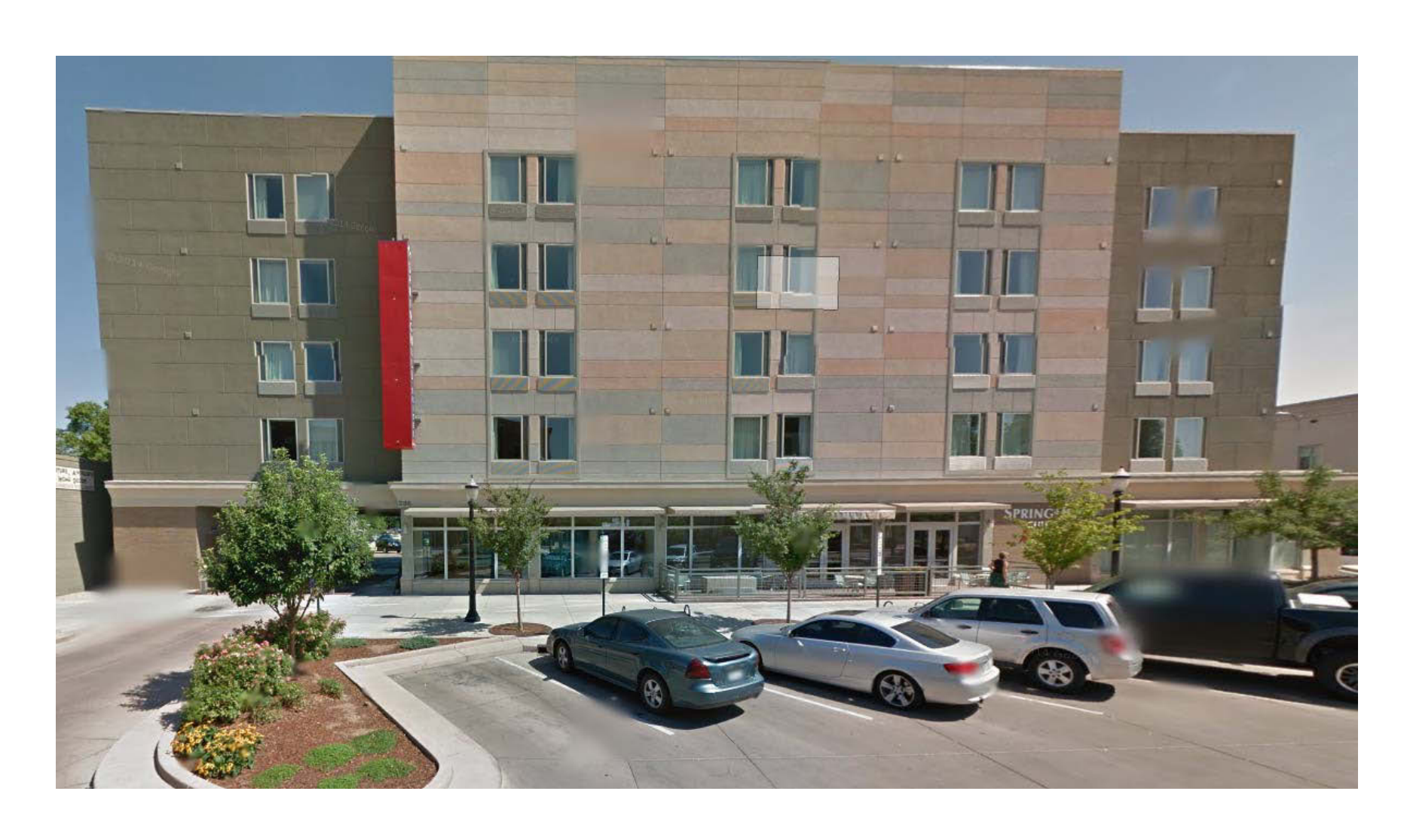
236 Main Street Current Google Street View Supplement July 2012