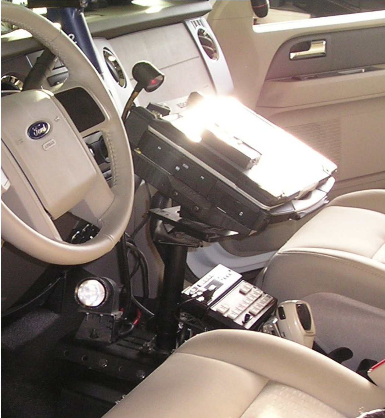
Ford Expedition – Havis dock, 9" Gamber Johnson pole with quad-motion attachment below the dock