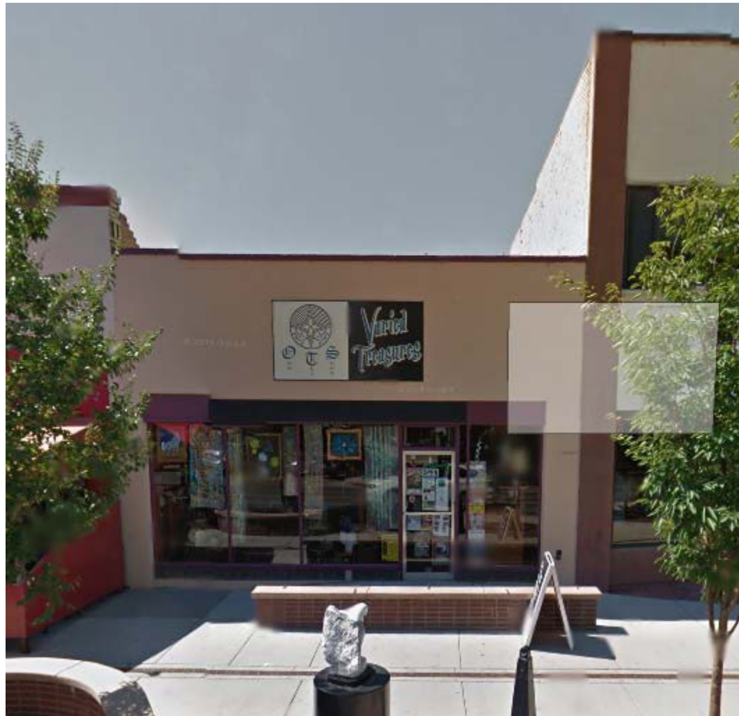
309 Main Street Current Google Street View July 2012