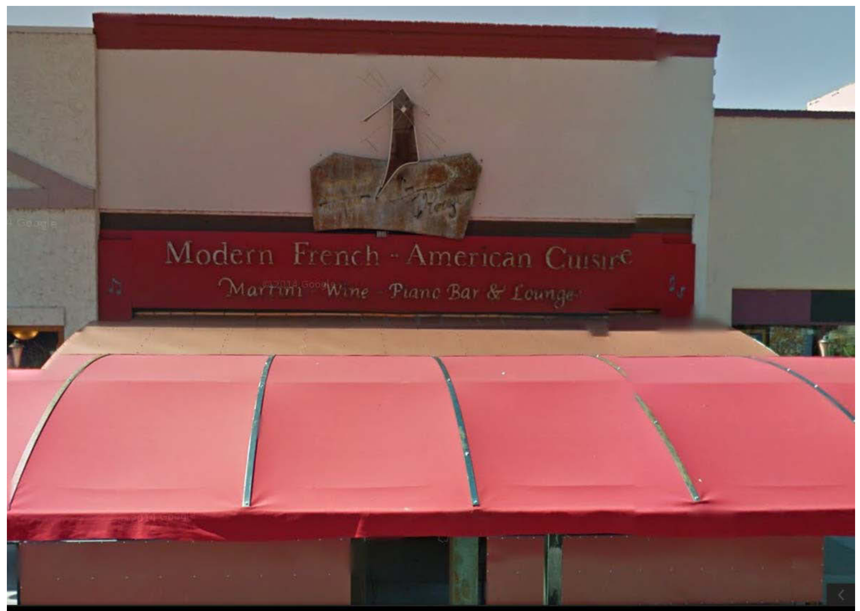
317 Main Street Most Current Google Street View July 2012