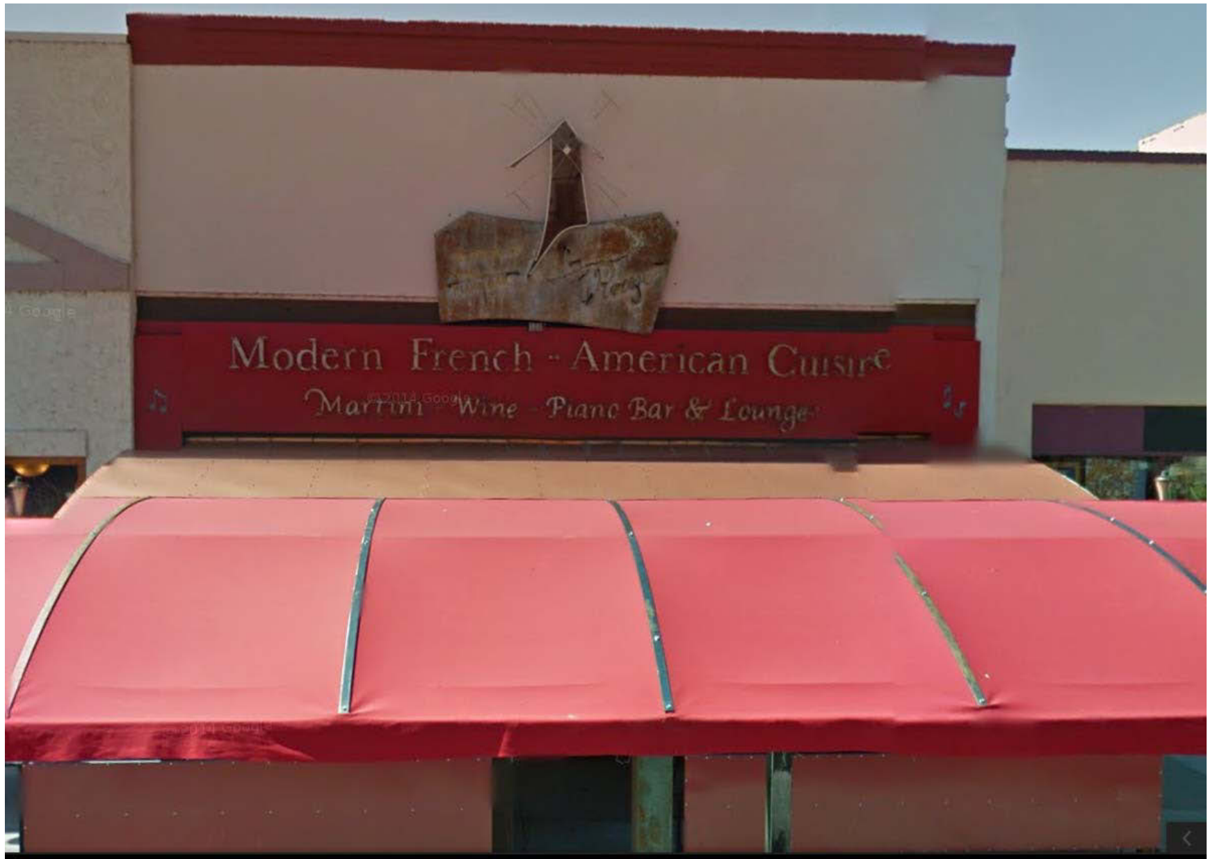
317 Main Street Most Current Google Street View July 2012