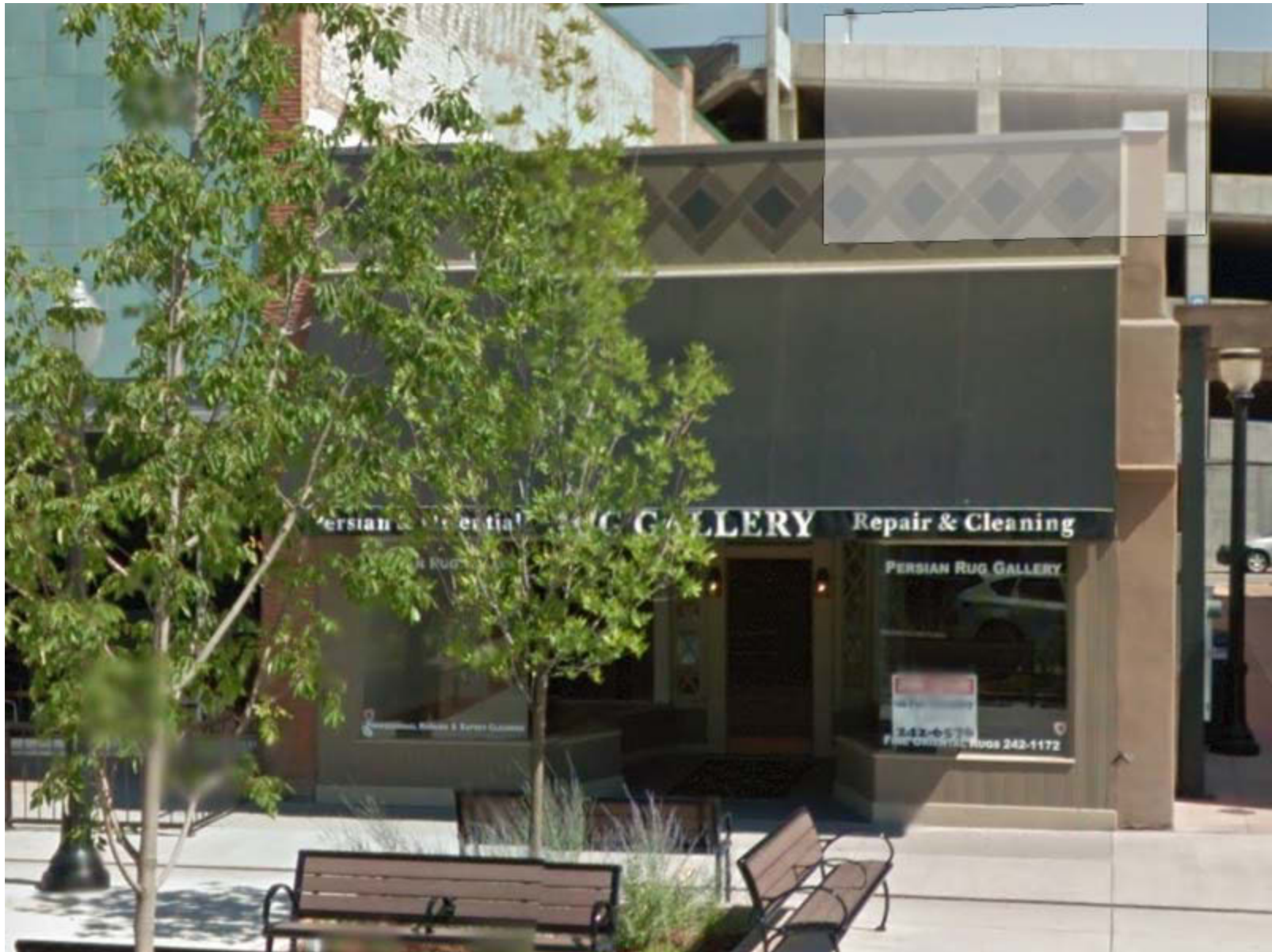
438 Main Street Most Current Google Street View July 2012