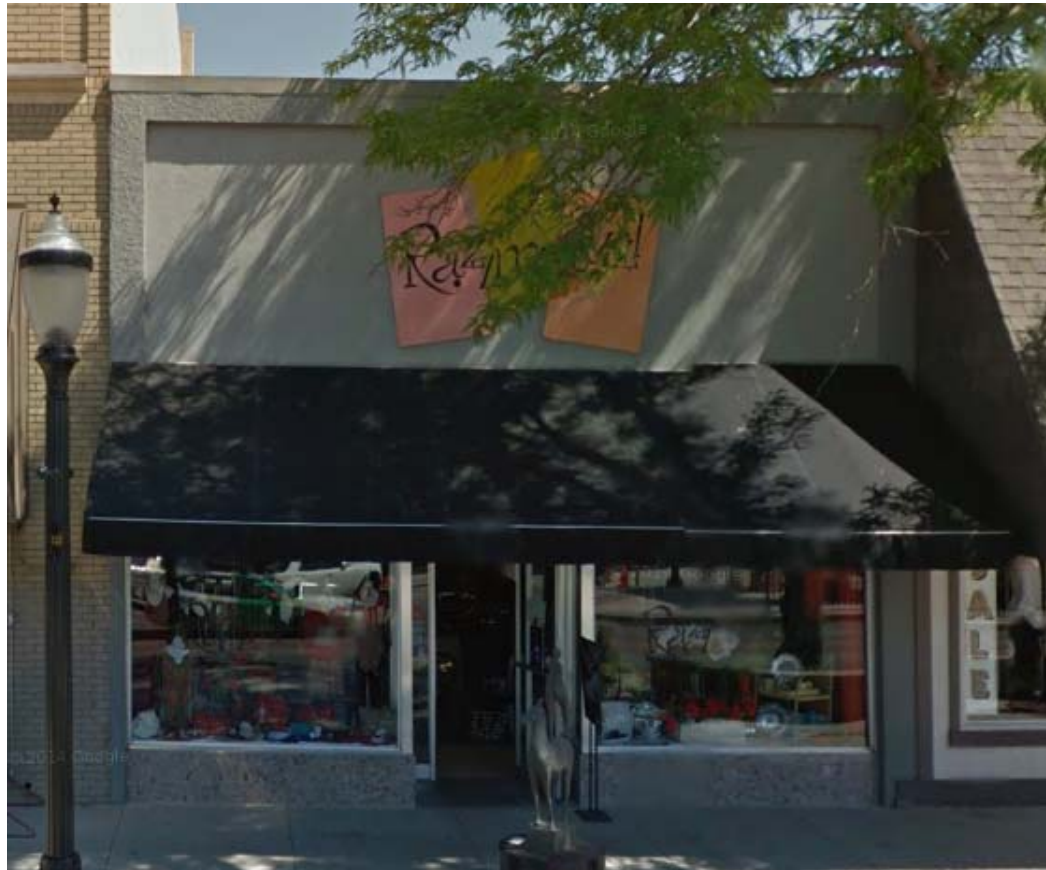
552 Main Street Current Google Street View July 2012