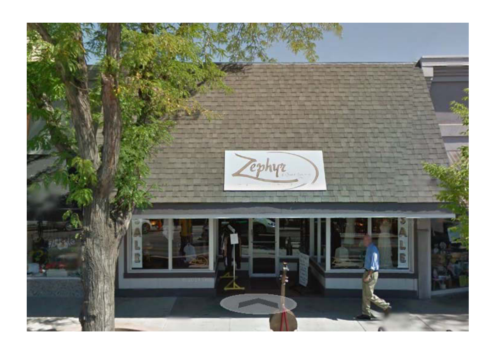
554 Main Street Current Google Street View July 2012