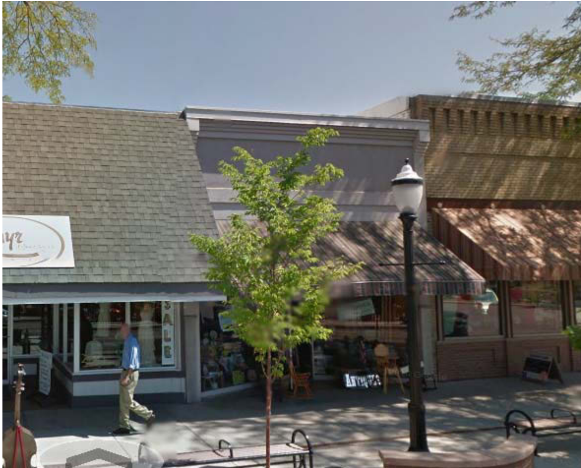
558 Main Street Current Google Street View July 2012