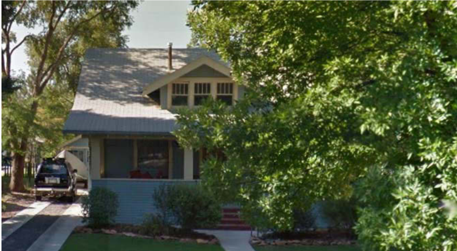
605 Gunnison Avenue Current Google Street View July 2012