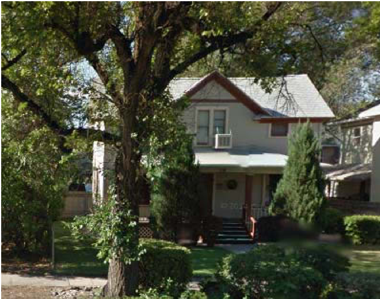
737 Gunnison Avenue Current Google Street View July 2012