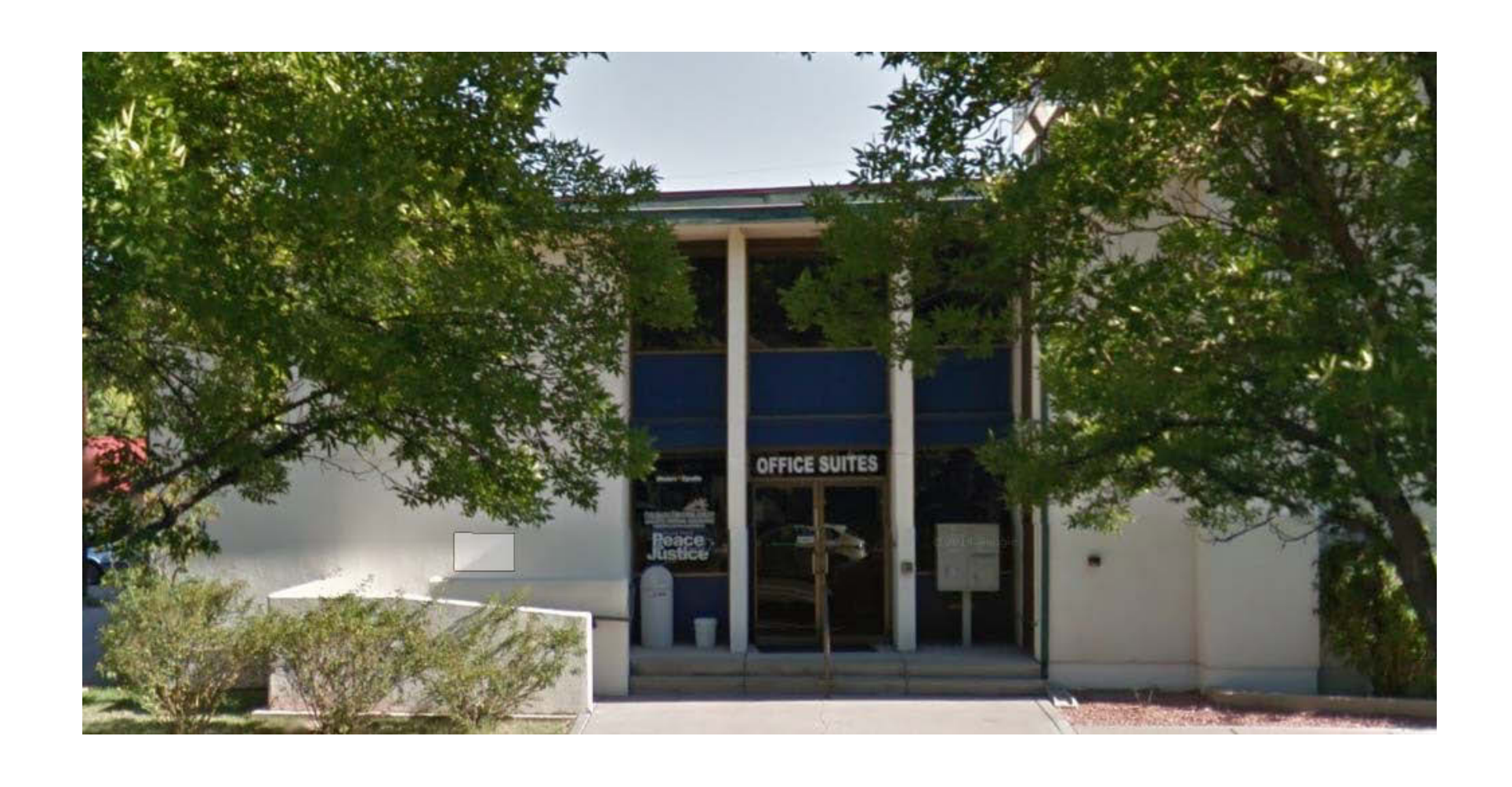
740 Gunnison Avenue Current Google Street View July 2012