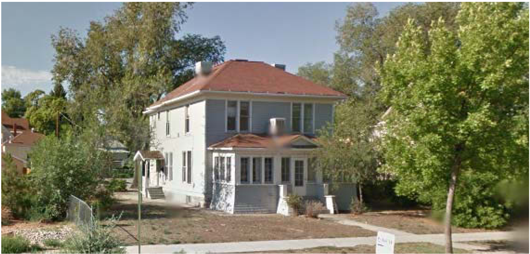
747 Gunnison Avenue Current Google Street View July 2012