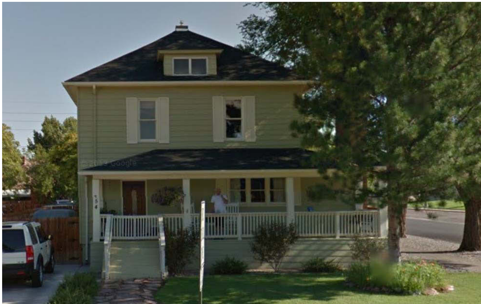
754 Gunnison Avenue Current Google Street View July 2012