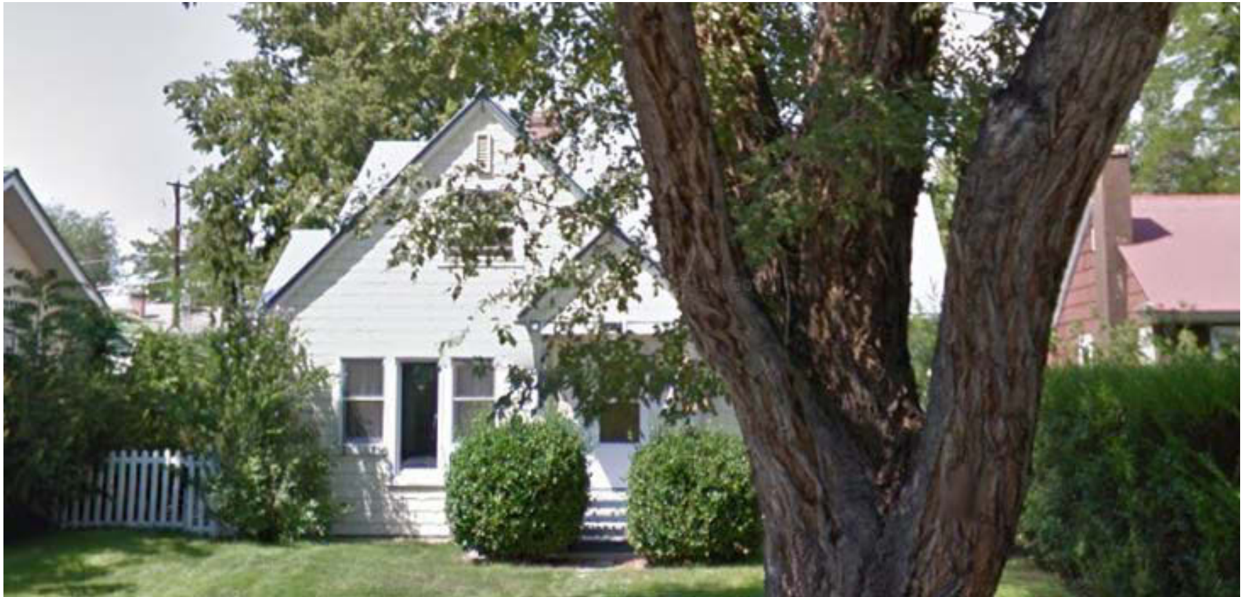
1120 Gunnison Avenue Current Google Street View July 2012