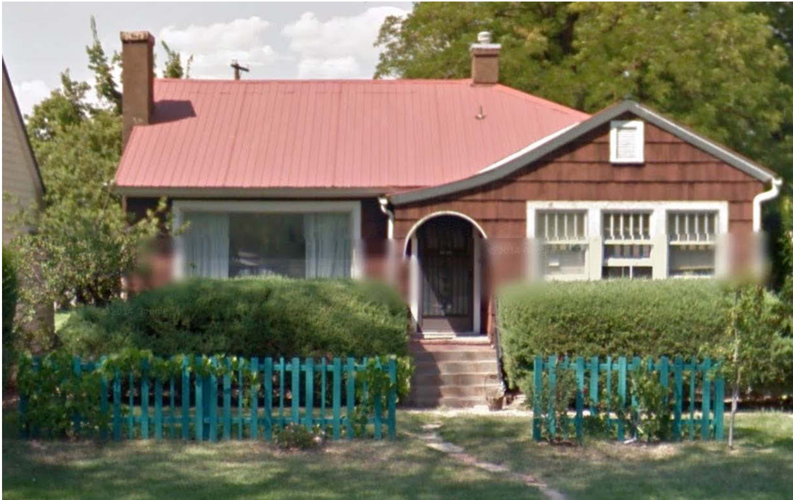
1124 Gunnison Avenue Current Google Street View July 2012