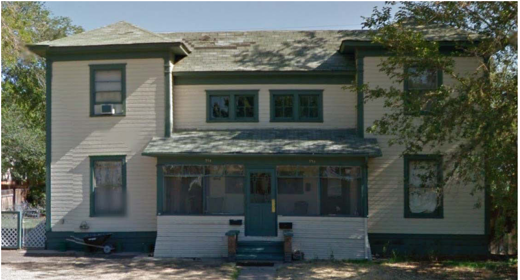
354/356 Ouray Avenue Current Google Street View July 2012