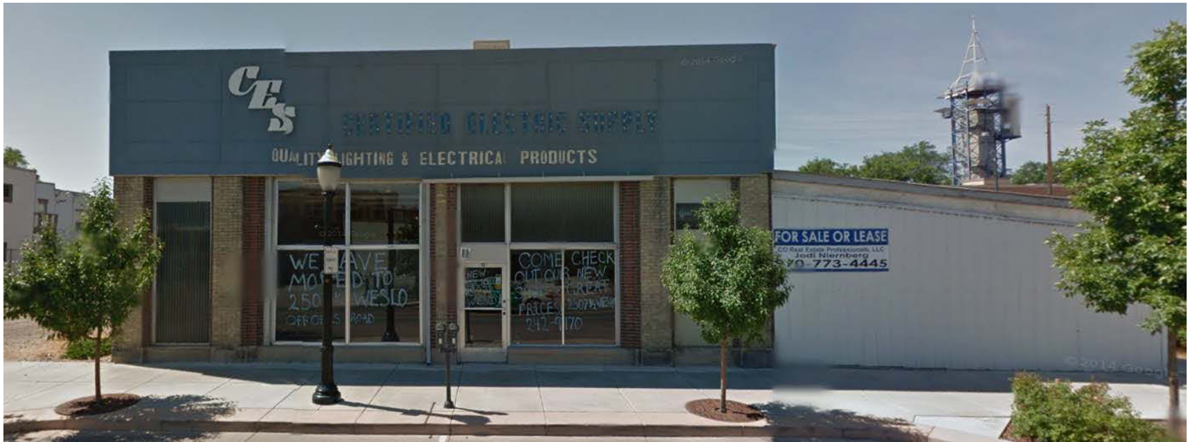
503 Colorado Avenue Current Google Street View July 2012