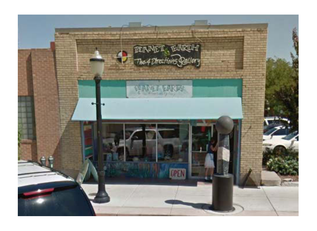
524 Colorado Avenue Current Google Street View July 2012