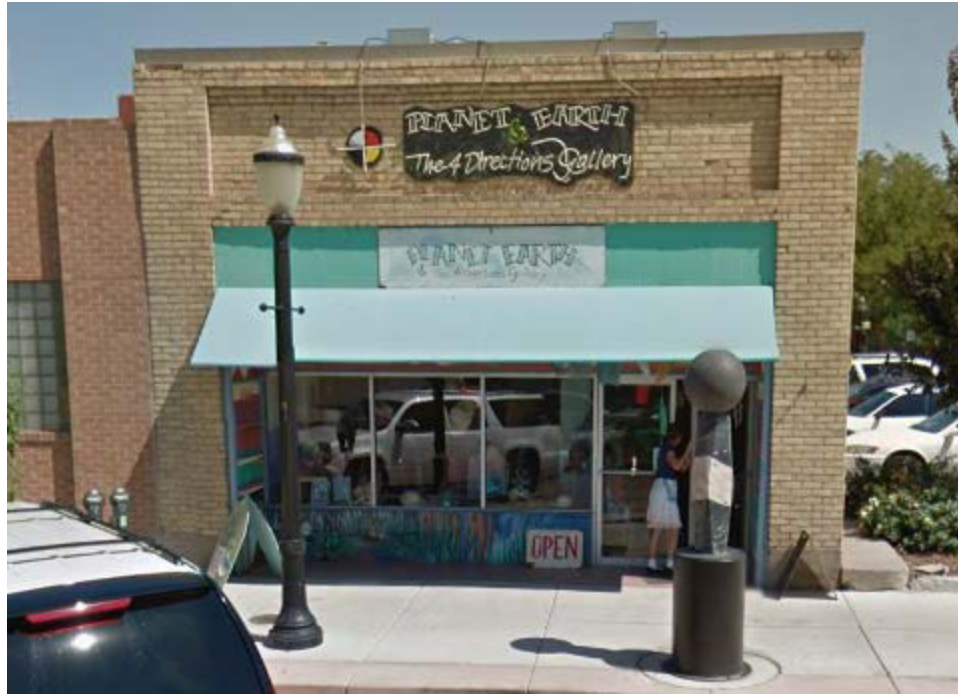
524 Colorado Avenue Current Google Street View July 2012