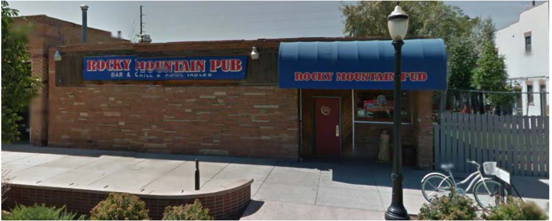
539 Colorado Avenue Current Google Street View July 2012