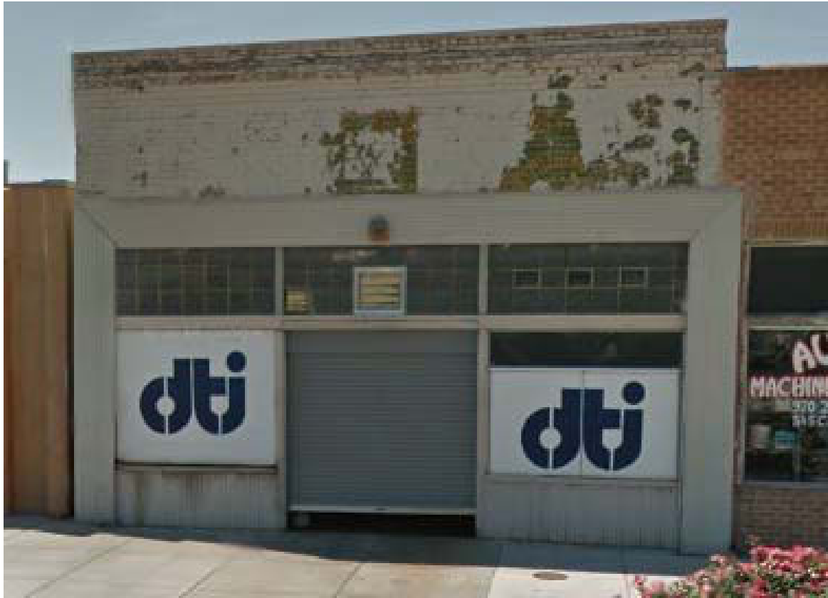
545 Colorado Avenue Current Google Street View July 2012