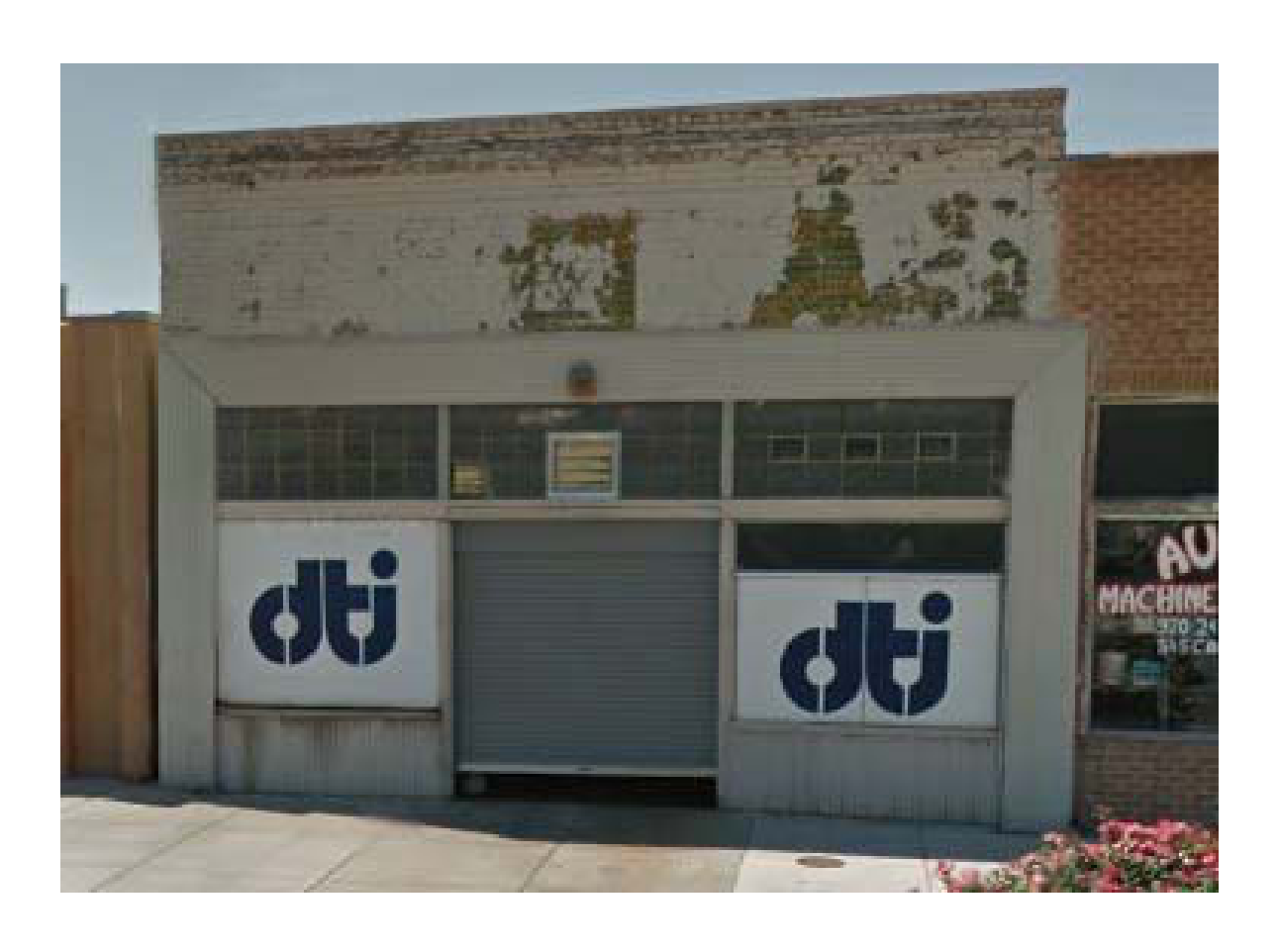
545 Colorado Avenue Current July 2012