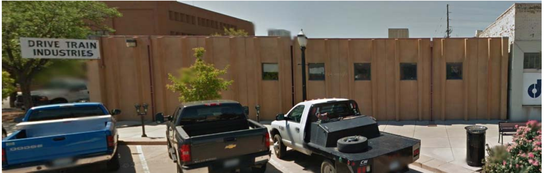
555 Colorado Avenue Current Google Street View July 2012