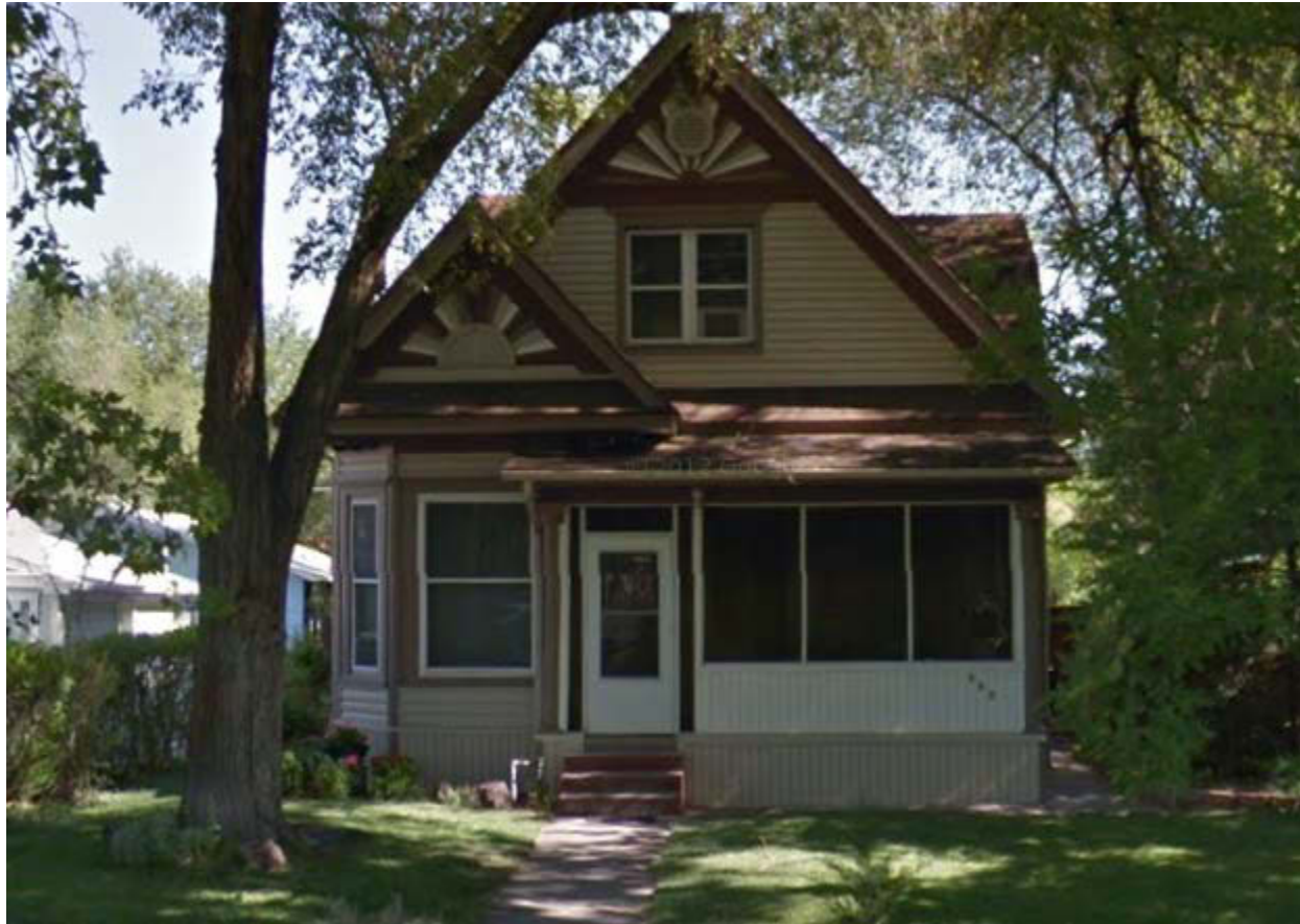
540 Chipeta Avenue Current Google Street View July 2012