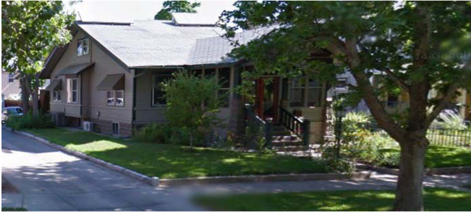
726 Chipeta Avenue Current Google Street View July 2012