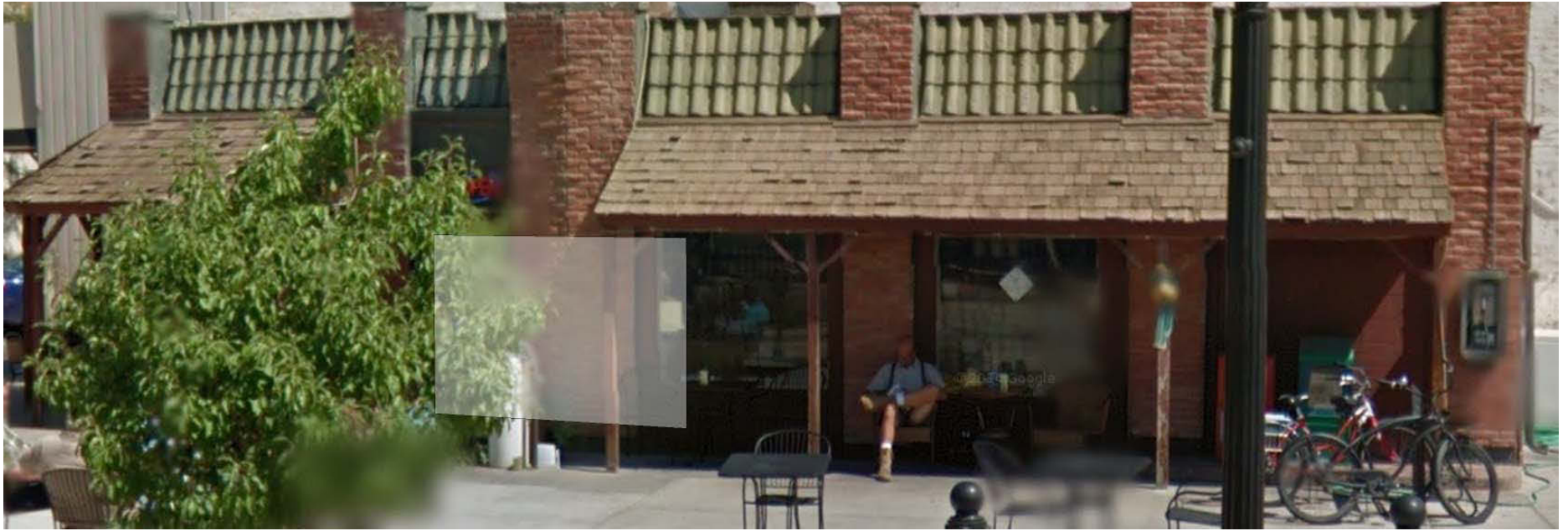
502 Colorado Avenue Current Google Street View July 2012