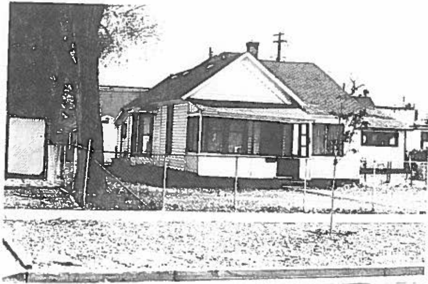
247 White Ave., Grand Junction, Mesa Co, CO 2945-143-11-007 04/29/1996 Roll 42 Frame 21 View N Dir SW • 5ME8624