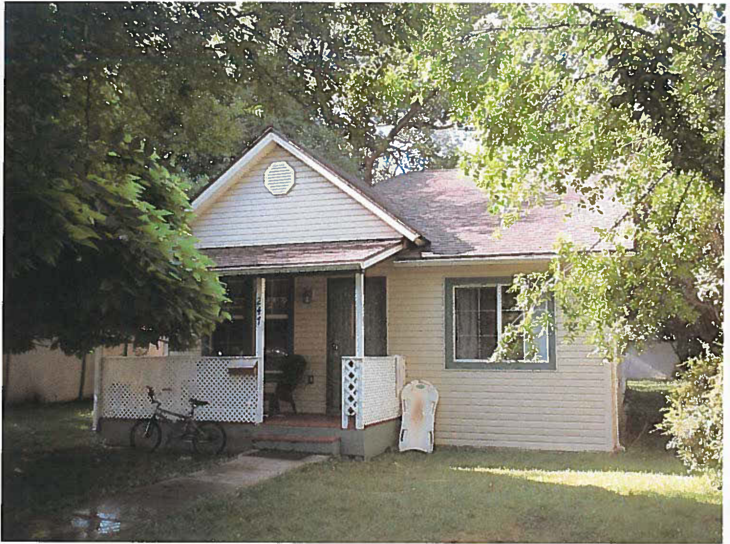
247 White Avenue Grand Junction CO - North Facade

Resource Number: Temporary Resource Number: