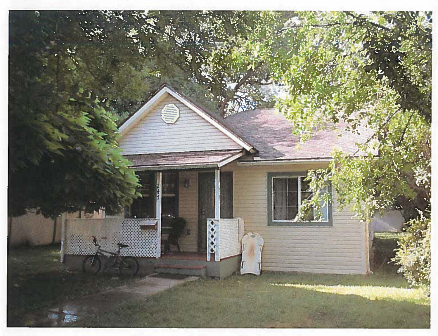
247 White Avenue Grand Junction CO - North Facade