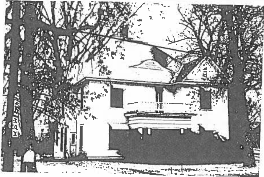
2112 N. 1st St., Grand Junction, Mesa Co, CO 2945-112-15-014 1/30/1996 Roll 22 Frame 22 View W Dir E/SE SME7638