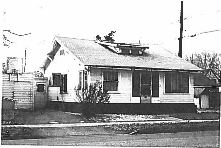
619 N. 12th St., Grand Junction, Mesa Co, CO 2945-141-30-018 1/29/1996 Roll 20 Frame 08 View E Dir NW 5ME7888